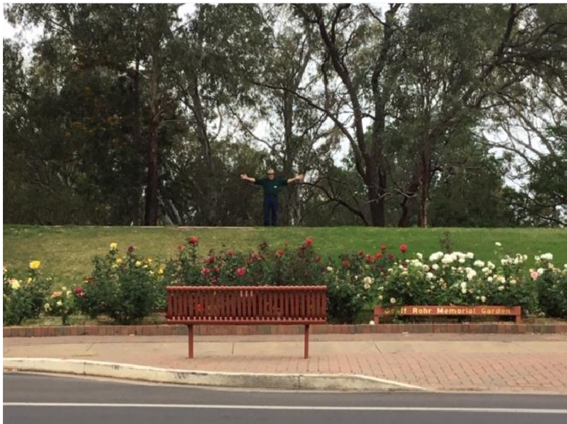
(Selected location within Memorial Precinct for Rising Sun structure)

The funding for the project of $30,000 is through the Community Hub and Activation element of the Stronger County Community Round 3 fund.