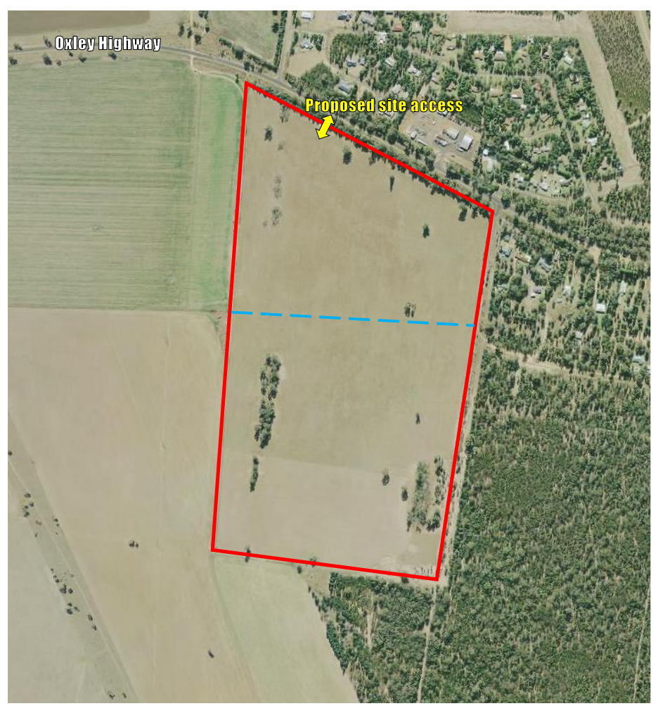
Figure 2: Subject land, with indicative proposed site access, Oxley Highway

The balance of the land would be retained by the landowner and potential longer term industrial growth land, noting there is a solar farm development approval on this land (not yet constructed).