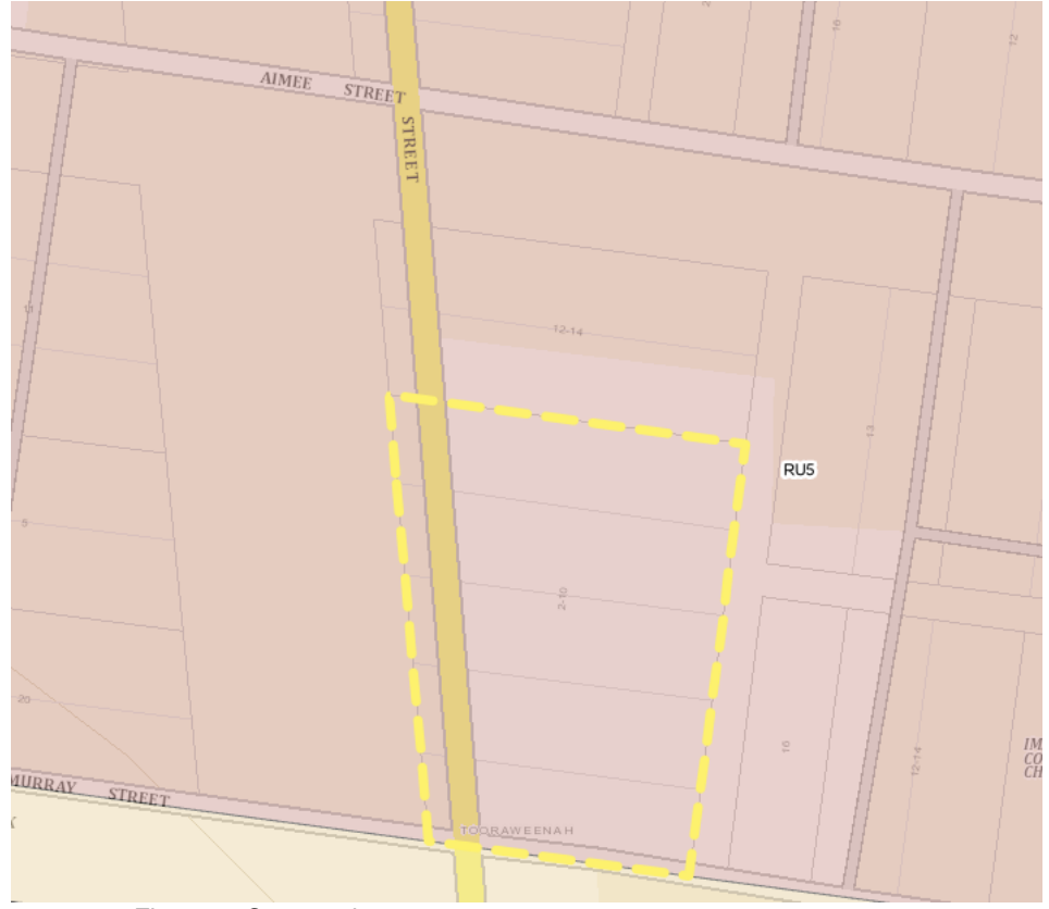
Figure 1: Current site

The land is zoned RU5 Village and a service station is a permissible use with consent under the provisions of the Gilgandra Local Environmental Plan 2011 (LEP).