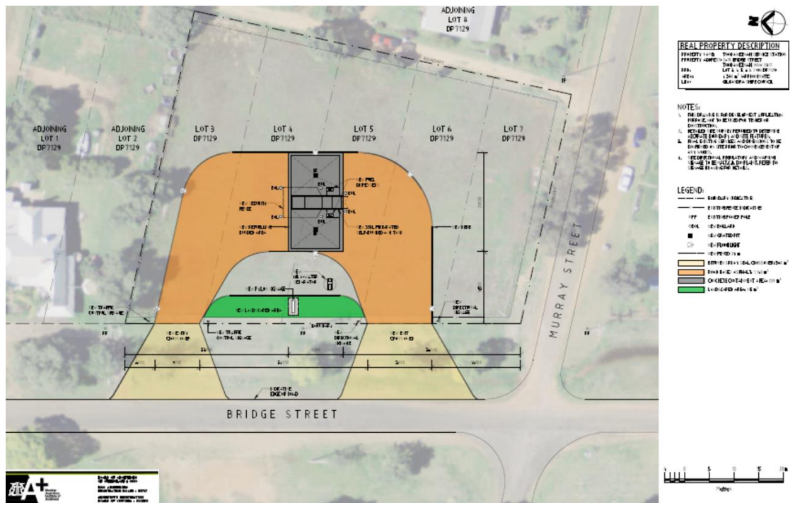
Figure 2: Proposed site layout, indicative only

The development proposes to construct a new unmanned service station, including construction of new crossovers off Bridge Street, earthworks, landscaping and on-site structures including fuel storage and dispenser, oily water separator and a new pylon sign. The proposal is designed to cater for two B Double trucks to fuel up concurrently and operate 24 hours, 7 days week with all traffic entering and exiting Bridge Street via a single direction driveway.