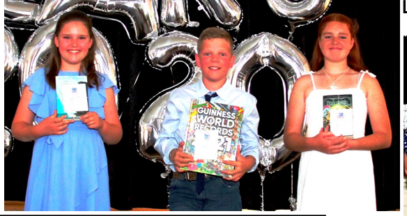
International Women's Day 2021