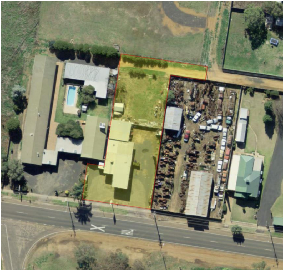
Figure 1: Subject Site