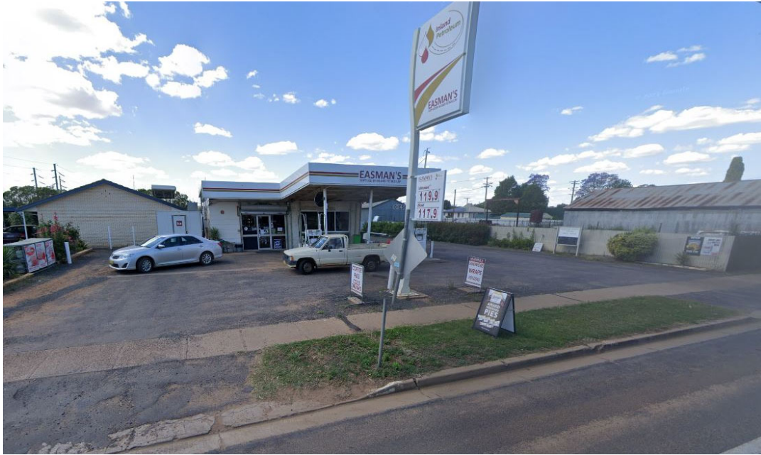
Figure 2: Subject site viewed from Warren Road