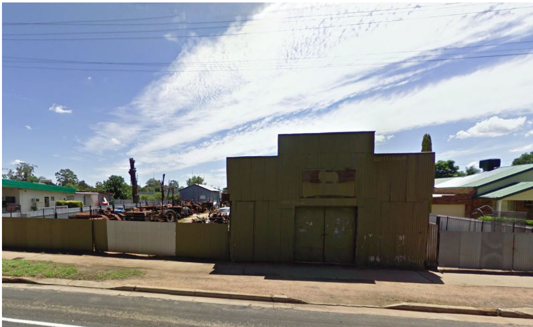
Figure 3: 170 – 172 Warren Road