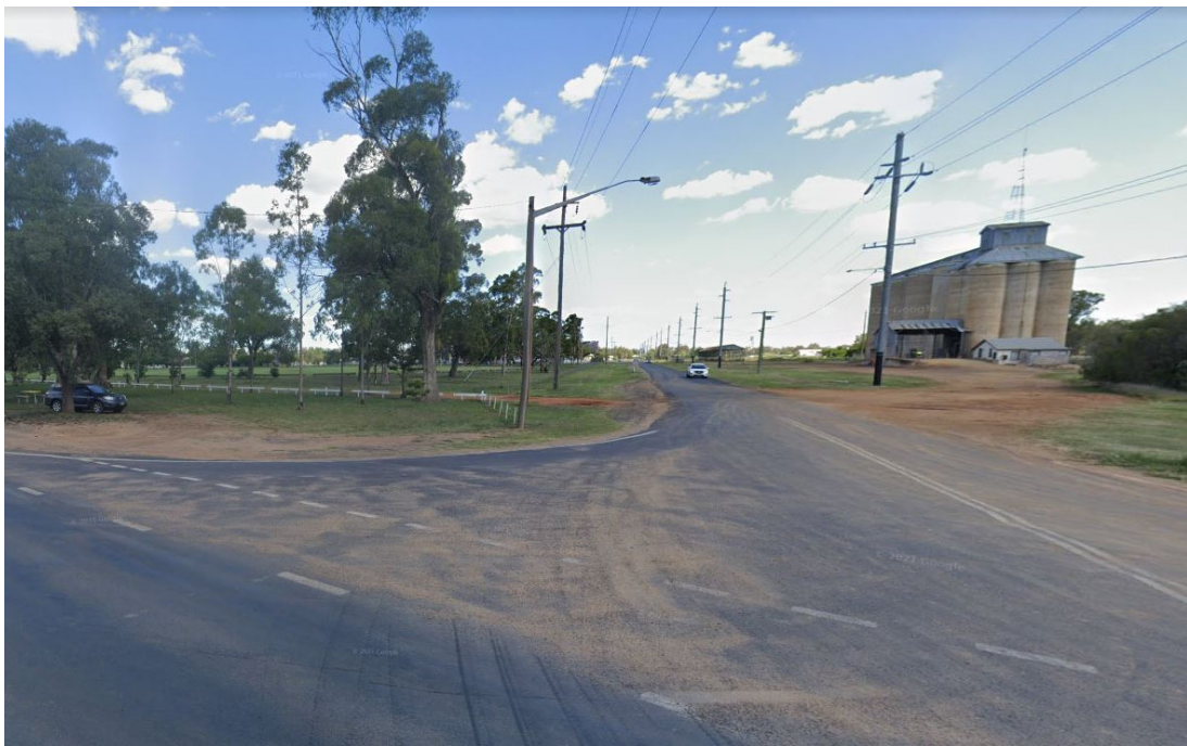
Figure 5: Corner of Warren Road and Railway Street