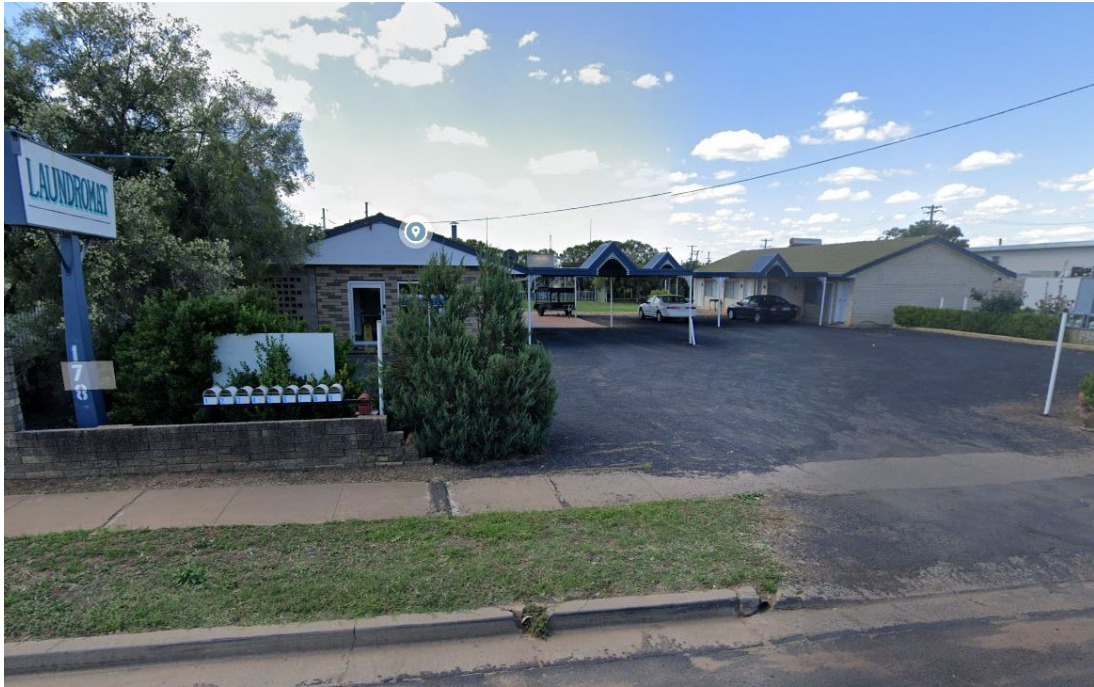
Figure 4: 178 Warren Road