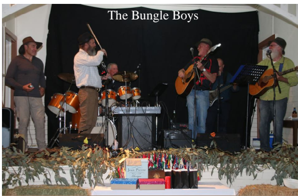
The Bungle Boys