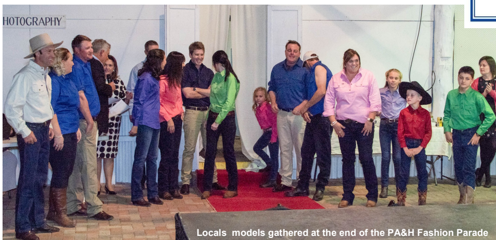
Locals models gathered at the end of the PA&H Fashion Parade