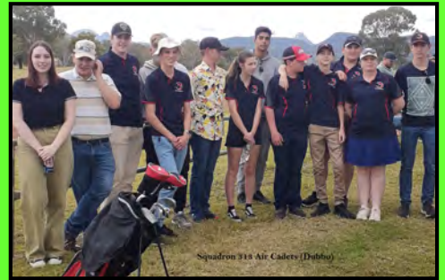
Squadron 313 Air Cadets (Dubbo)