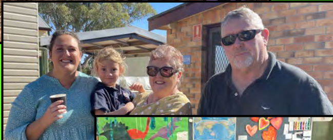
Split Rock Hike School Open Day and the TPS Cross Country