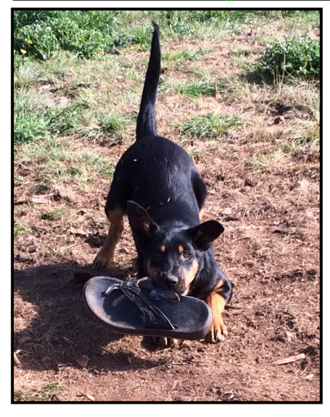
Rearing a pup can be a lot of fun ,but there's a high chance they have given you a few premature grey hairs. Pups can be mischievous and naughty ,they do puppy things, they