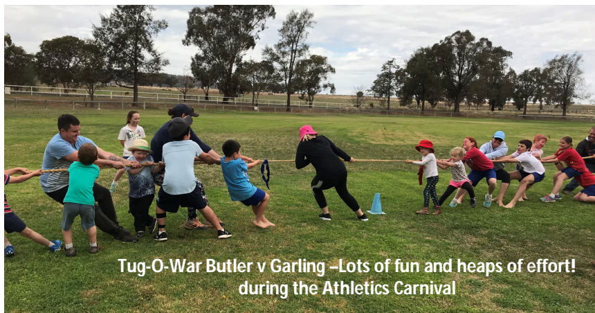
Tug-O-War Butler v Garling –Lots of fun and heaps of effort! during the Athletics Carnival