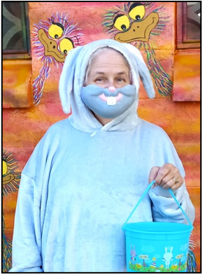
Editor's Note: See the rave reviews online from visitors to the Tooraweenah Caravan Park. Fantastic!

RSVP BY WEDNESDAY 4TH MAY Every mother gets a free glass of wine on arrival