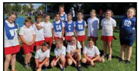
Small Schools Sparklers (Toora, Carinda & Quambone) –Coonamble Net Ball Gala Day