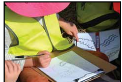
Photo: Aboriginal Symbols in our Scrap Book