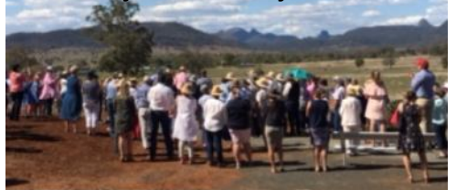
Some of the crowd watching the unveiling of the Sculpture by Sonny Sandford on the Centenary of Armistice Day 2018

There will be a film screening of the play Piano Forte, which explores elder abuse, followed by a discussion and a chance to ask the panel members questions. Free Refreshments will be provided. Transport is available from the Village with the Community Bus which is $10 return ring 6817 8750 to book.